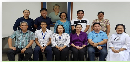
APNIEVE Officers and Regional Coordinators during Strategic Planning