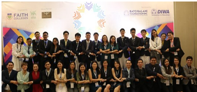
Student-delegates, accompanying teachers, and organizers of the ASEAN Convergence Secondary Schools

dialogue and intercultural learning. The activity was inspired by the ASEAN Schools Tour, a commemorative activity held in 2007 as part of the ASEAN's 40 th anniversary attended by ASEAN Secretary Ong Keng Yong. FAITH Colleges was one of the host schools of the ASEAN Schools Tour.