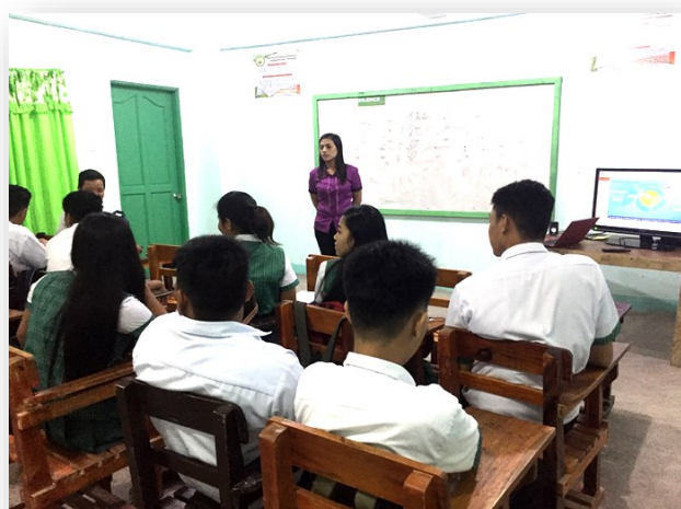
Curriculum enhancement model teaching and critiquing