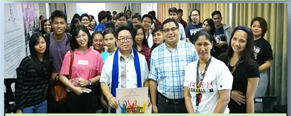
City College of Angeles College Students