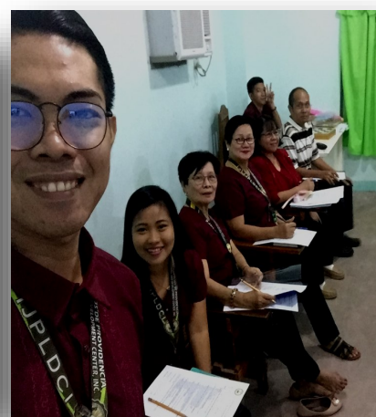
The Professional Learning Committee of IJPLDCI