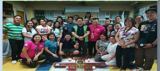
Justice Jose Abad Santos General Santos Professional Nurses